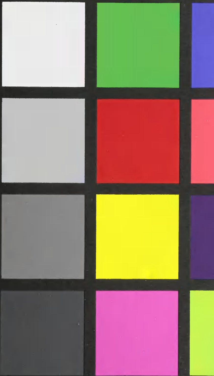
GretagMachbeth™ ColorChecker Color Rendition Chart